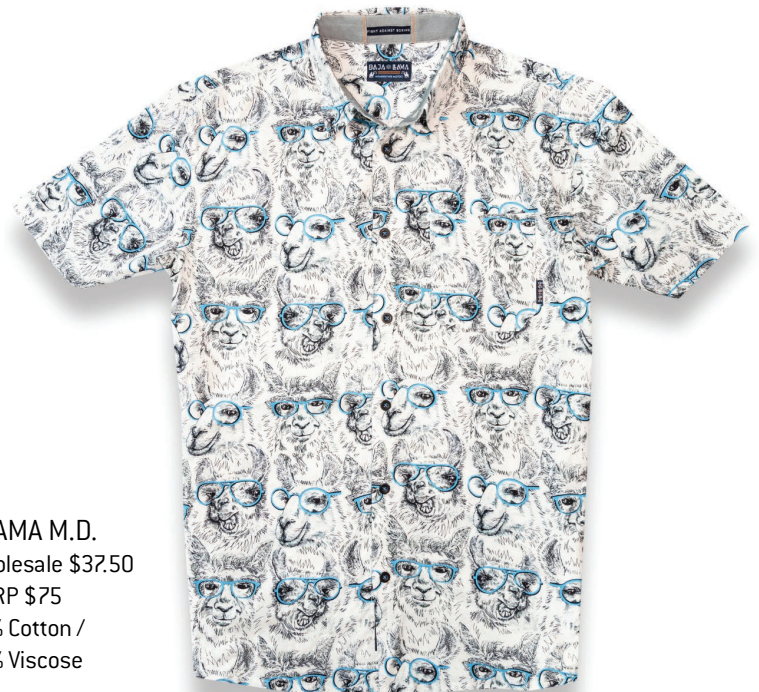
LLAMA M.D. Wholesale $37.50 MSRP $75 60% Cotton / 40% Viscose