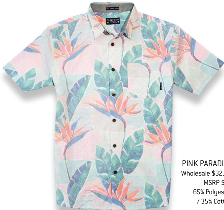
PINK PARADISE Wholesale $32.50 MSRP $65 65% Polyester / 35% Cotton