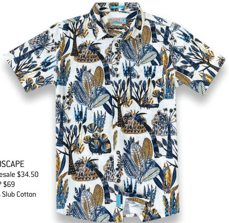
DINOSCAPE Wholesale $34.50 MSRP $69 100% Slub Cotton