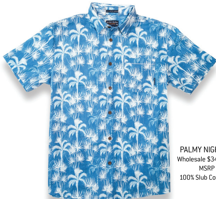
PALMY NIGHTS Wholesale $34.50 MSRP $69 100% Slub Cotton